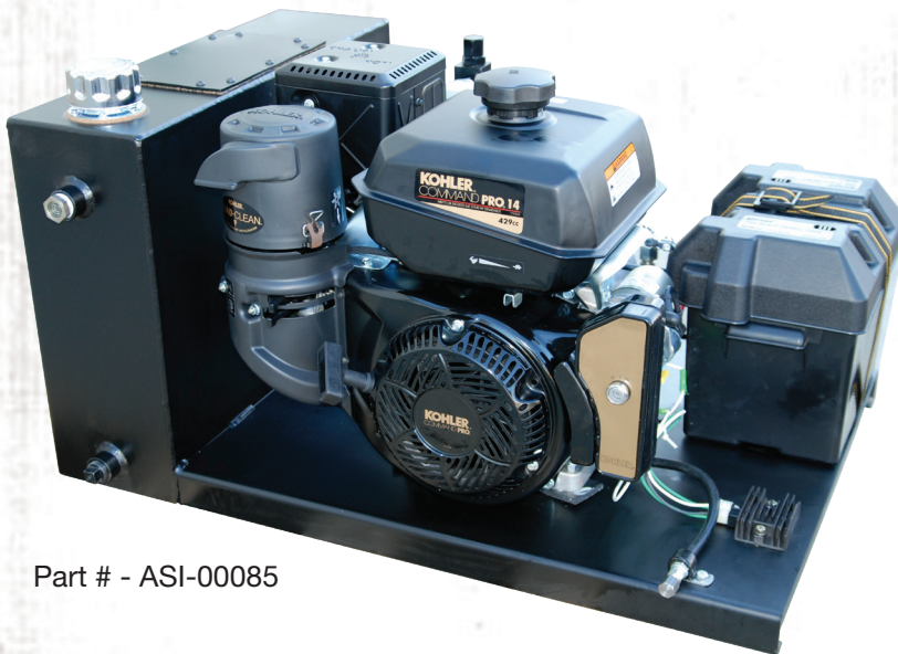
Part # - ASI-00085