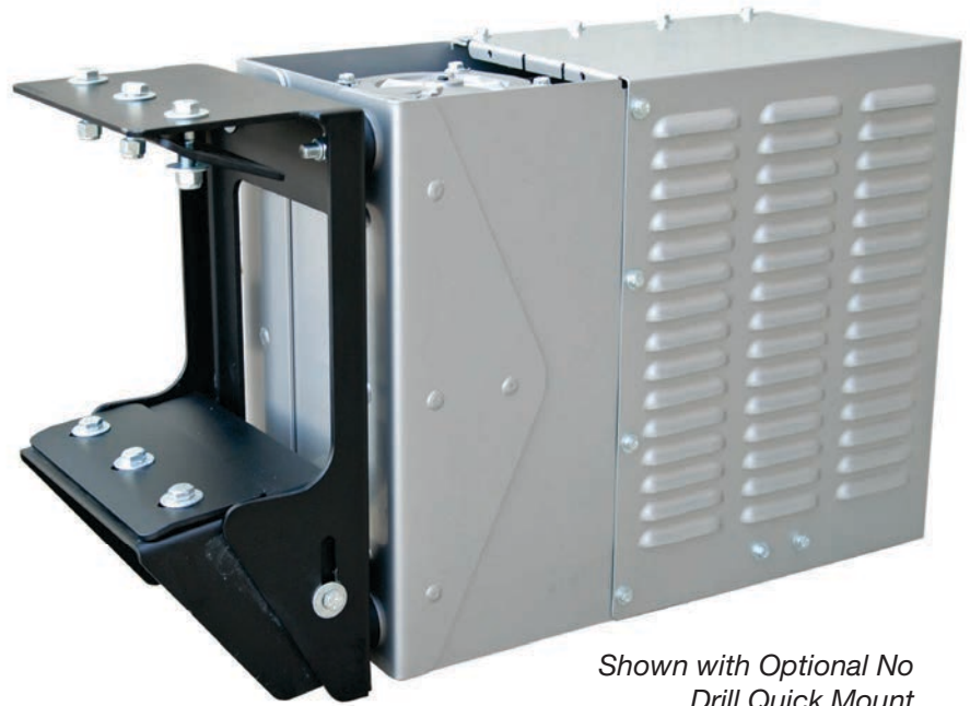
Shown with Optional No Drill Quick Mount