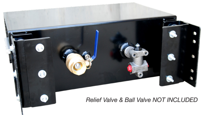
Relief Valve & Ball Valve NOT INCLUDED